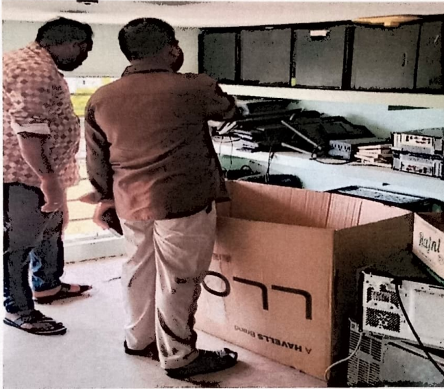
The Students and Faculty members rendered their fullest cooperation on collecting an e-Waste.

e – WASTE MANAGEMENT PHOTOS – 03rd JUN 2023